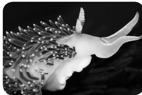
Glorious Slug