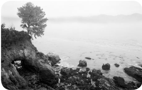
San Simeon in Fog